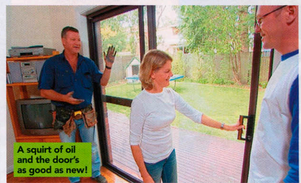
A squirt of oil and the door's as good as new!

The best oil to use for this is heavy-grade clock oil as there's less chance of this type of oil gumming up later. Speak to a watchmaker about where to find clock oil."